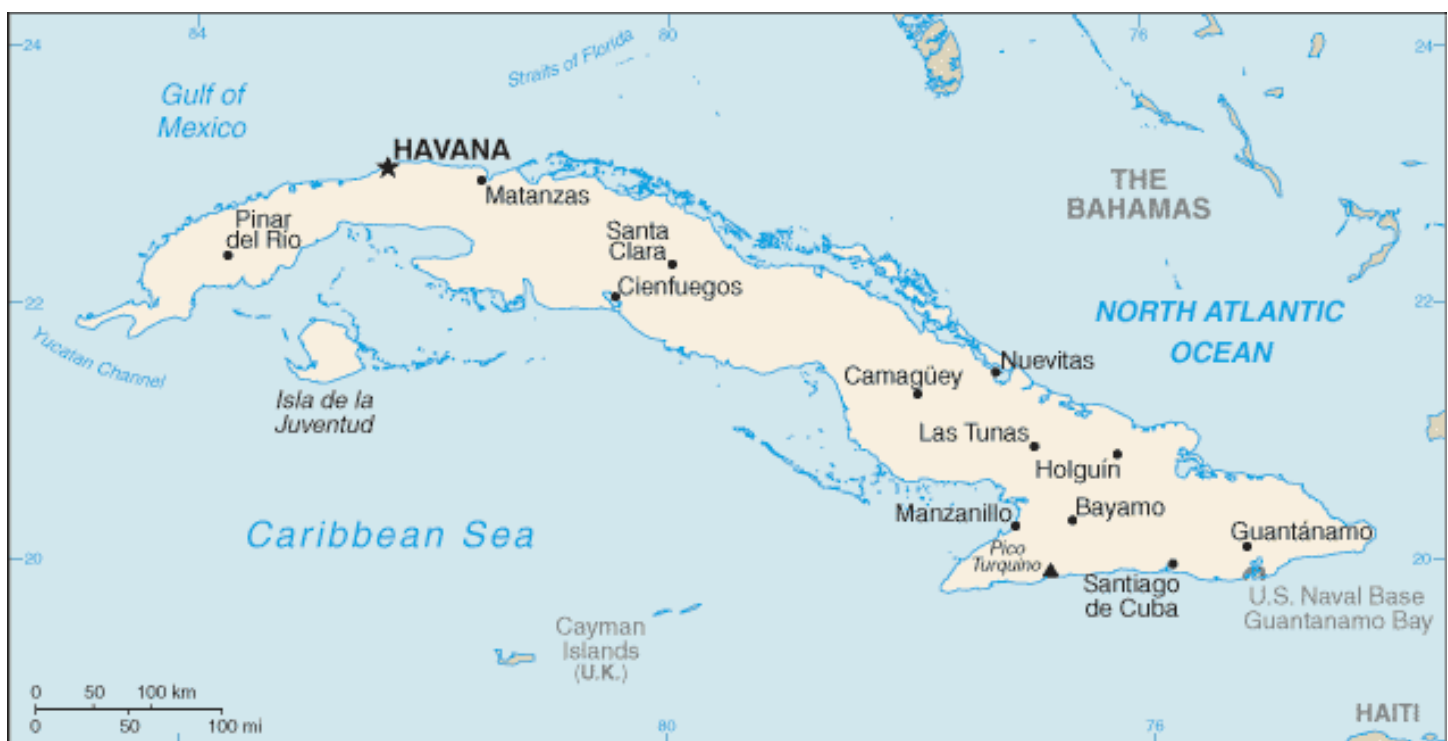
Map from CIA World Fact Book: Cuba